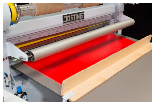
from roll to sheets

This machine makes any piece and any roll you require out of your roll stock.